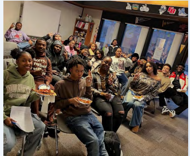
DVC students at movie night

Union (BSU) also hosted various student-led discussions and activities on campus.